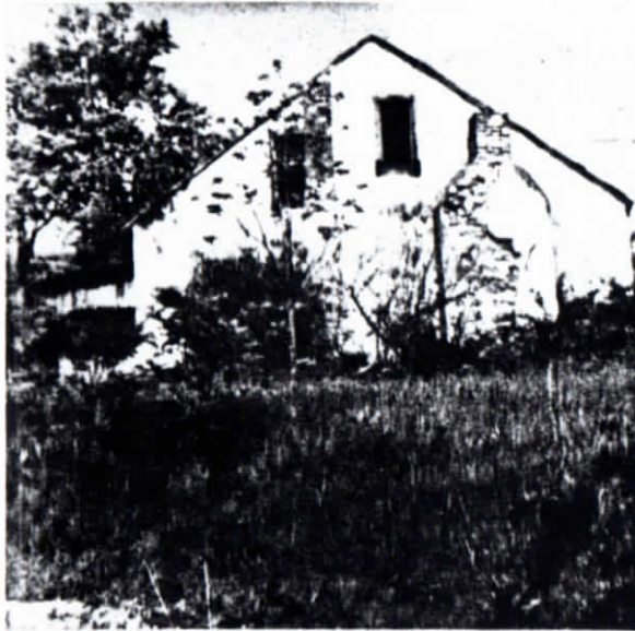
A Waters Plantation House of Early Seventeen Hundreds on Jericoe — Cherry Walk Wrecked by Hurricane Hazel in Recent Years.