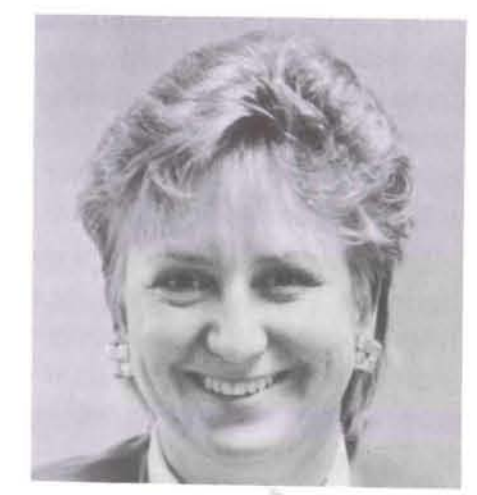
President Coxco, Inc.